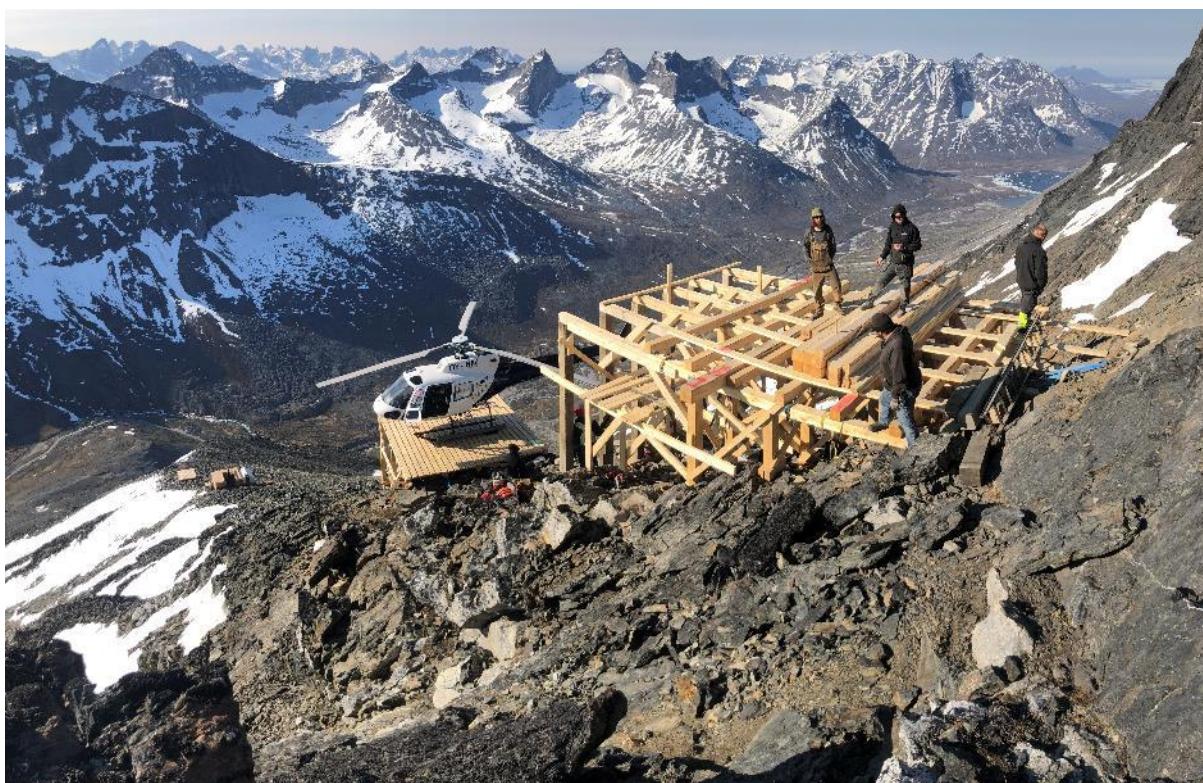
Figure 2. Mountainside drill platform while under construction and used during the 2023 drilling programme

As with previous programmes, the drilling was completed using the Company's structural Dolerite Dyke Model, which has proved to be an effective targeting tool. A particular highlight