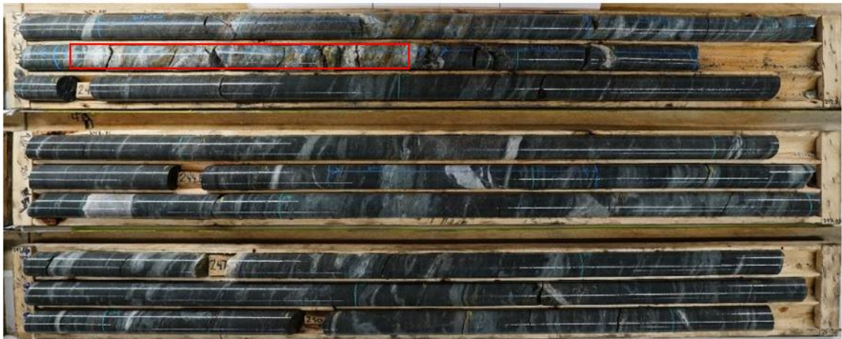
Figure 3. AEX2305 Main Vein intersection, 240.15 to 240.84 m grading 182 g/t Au

was a 0.69m intersection of the Main Vein, with significant visible gold which resulted in the highest grade ever intersected by the Company, (182g/t Au over 0.69m from NAL2305), breaking the previous record set during 2022 (116g/t Au over 0.62m from AEX2237).S